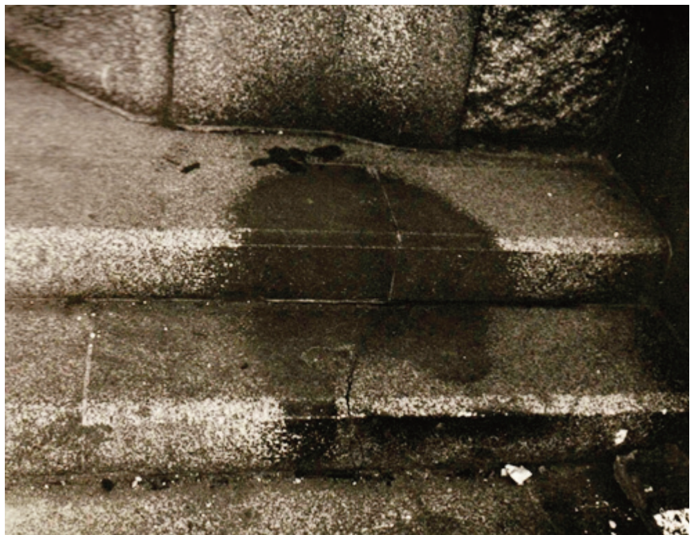
Human consequences: nuclear blast 'shadow' from Hiroshima

As nuclear tensions mount and the risks increase, efforts to expose the horrors of and eliminate nuclear weapons are as important as ever.